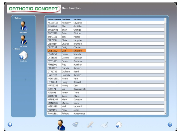
Fig. 2 - Patient details are securely managed