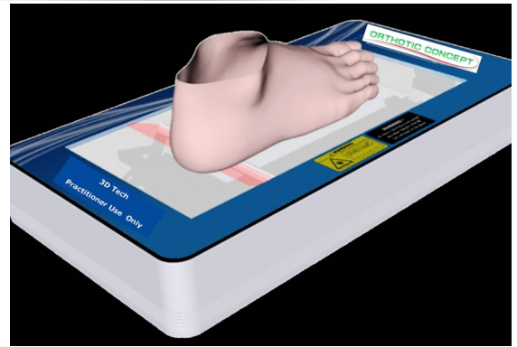
Fig. 1 Scanning a foot, a cast and a foam box

Direct lab link – the complete order can be automatically transferred to the laboratory.